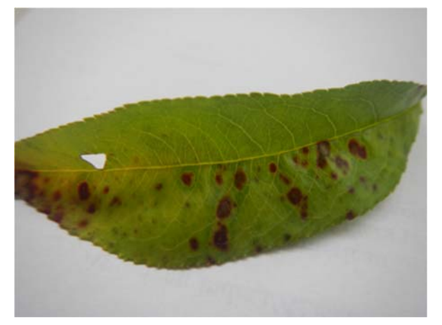
One of the many plant disease samples brought into the Extension office for identification.