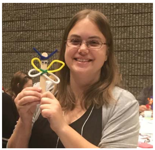
Many trainings are held to spread new ideas and knowledge including the Power of Puppets.

Taste testing fruits and vegetables during a "My Plate" presentation at the library was an enjoyable experience.