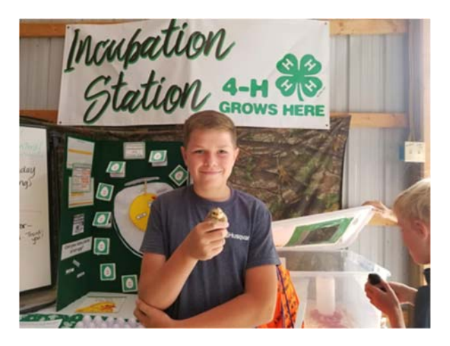
A series of community classes offered at the Falmouth Youth Show to increase knowledge and showmanship skills included the "4-H Incubation Station."

Early needle loss caused by brown spot needle blight shows up on infected Scotch pine in the fall before harvest making Christmas trees unsalable.